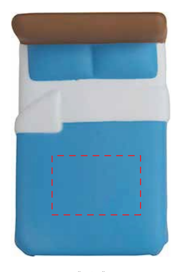
4" x 2.5"